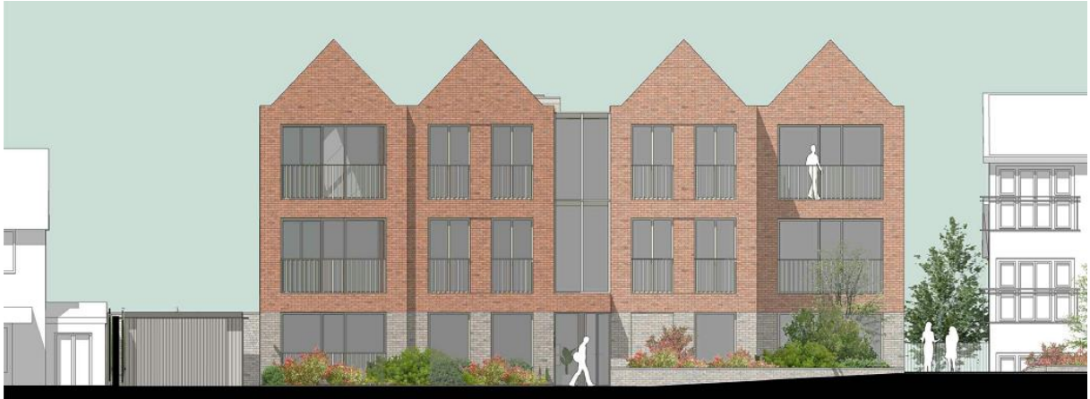
Proposed West Elevation (rear)