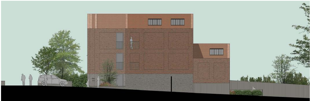
CGI – Front elevation from South East