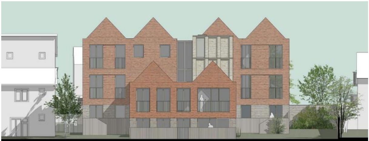
Proposed South Elevation (facing 95 King Georges Avenue)