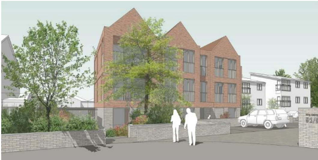
CGI – Front elevation from North East